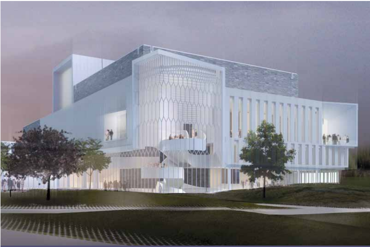
Architect's CAD rendering of the new Center for the Arts at Virginia Tech, opening in 2013.

As the Center for the Arts (CFA) takes shape on the east edge of main campus, the role of information technology may not be obvious. However, from the earliest stages of design, the technology infrastructure to support the center's programs has also been taking shape.